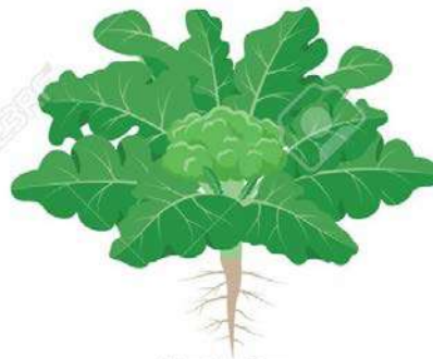
Maturity 50-100+ days

I have giant healthy leaves on my broccoli plants but no sign of anything that looks like the broccoli we eat. Do I need to do something?