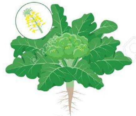
Flowers 60-100+ days