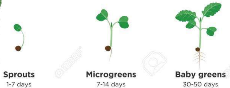
Sprouts 1-7 days